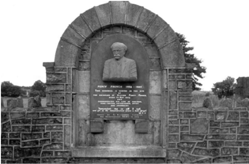
The Percy French Memorial in Roscommon

This space could be advertising your business!